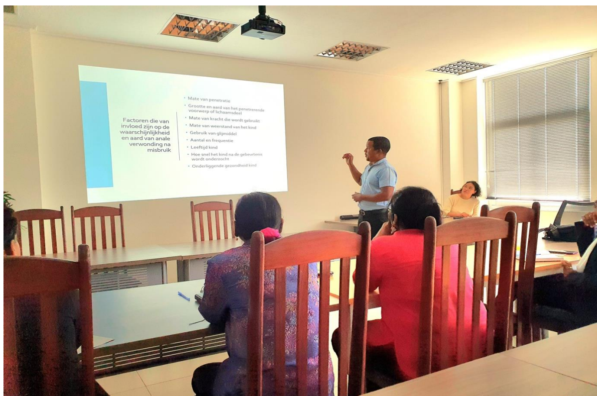
Figure 2. First training of the judges of the public prosecution service in Suriname, November 2022

The ministry of justice and police, for their access and expertise with the public prosecution service in Suriname.