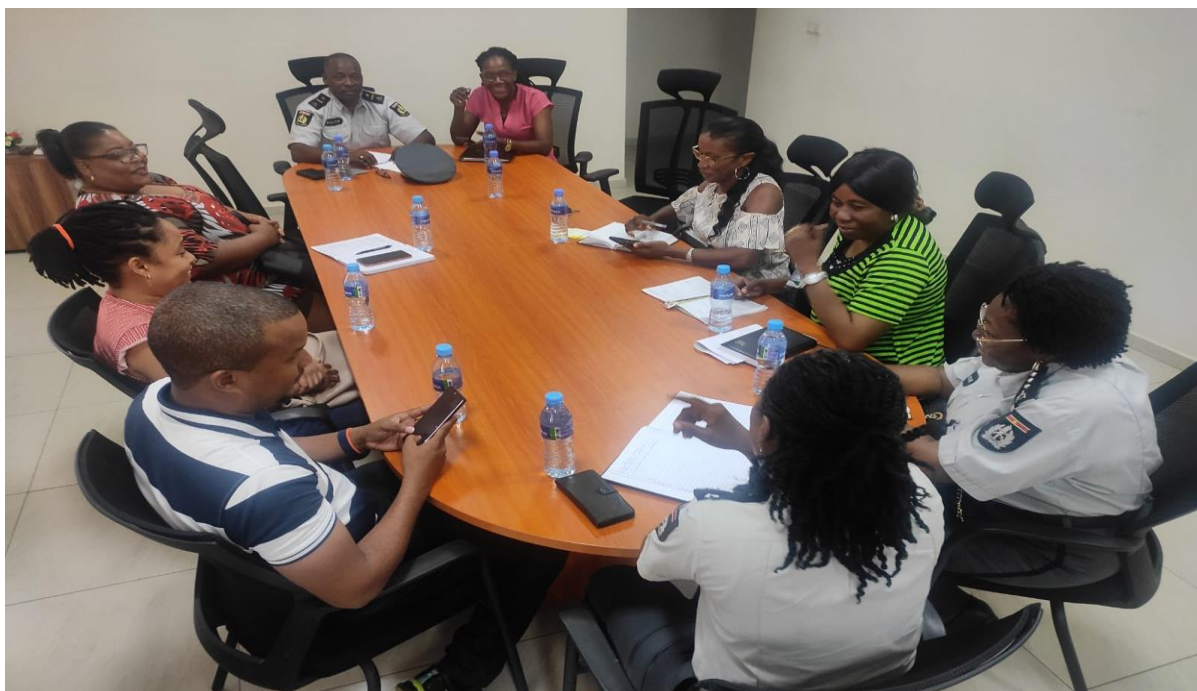
Figure 2. First meeting with the head of the police departments and the school leaders of the districts Wanica and Para in Suriname

The ministry justice and police, for their access and expertise with the local police departments and neighbourhood managers.